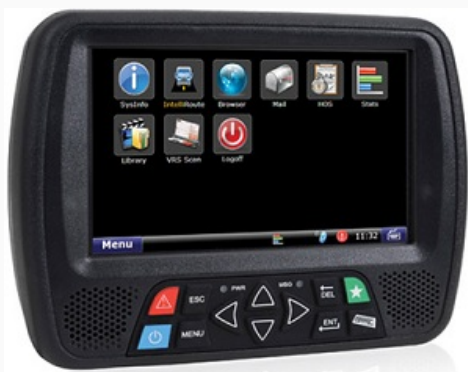
DT 4000 Installed in the vehicle