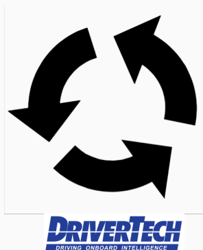
DT Cloud Synchronizes all connected devices