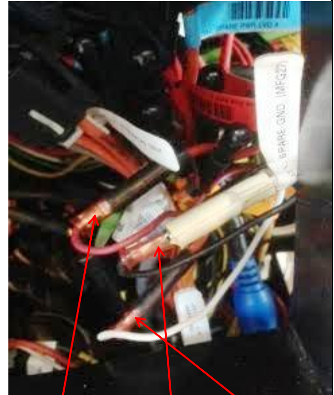
(Fig 4) snap connector wire colors Power.-Red, Ground.-White, Ignition- Orange