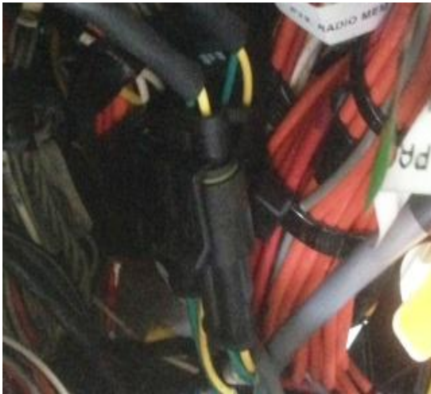
Fig (5) J1939 Super Seal connector Separate connector and join to DTY20687 Hydra cable mating connectors