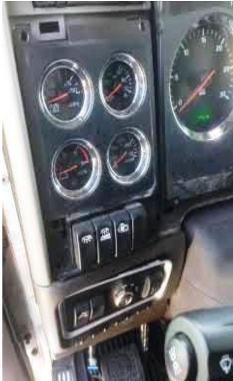
(Fig 1) Dash panels to remove