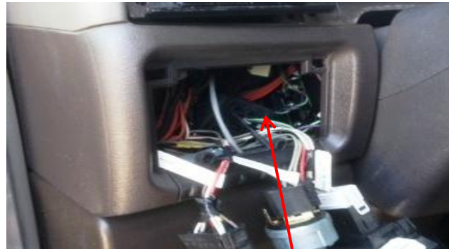
(Fig 3) Access to: J1587/J1708 Connector block