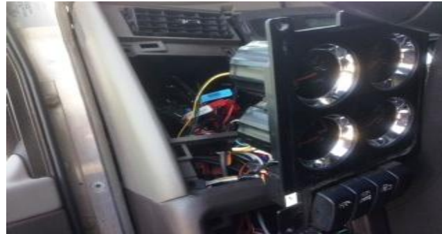
(Fig 2) Access to: pwr. gnd. ignition and J1939